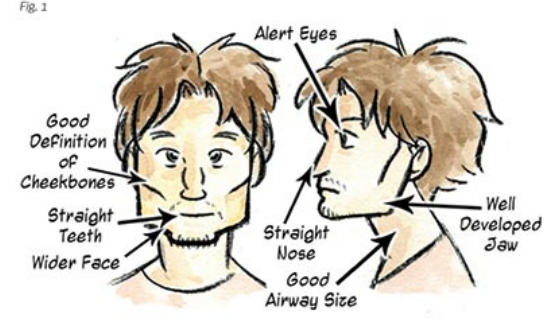
Fig. 1: The facial characteristics of a nasal breather. Based on Irish International and LA Galaxy soccer cantain Robbin Keane.

Mouth breathing can negatively affect the growth of the face and cause crooked teeth. The swallowing and chewing actions can also contribute to crooked teeth. For those undergoing braces, it can slow down the progress of treatment and increase the risk of relapse after completion. If not corrected, it can also lead to TMJ issues, speech distortions, muscular pain of the face, neck and back. Snoring and sleep patterns can be affected. All in all, it can affect the structural growth, function, and development of orofacial muscles.